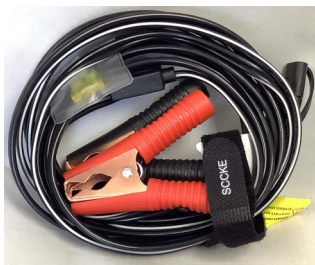
Wiring Harness Included